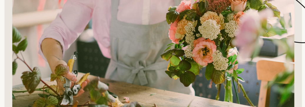
Celebrate remarkable women's strength and grace with a display of floral beauty at our evening event.